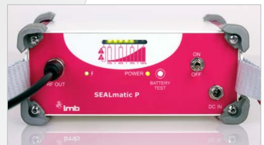
Battery status - current battery capacity