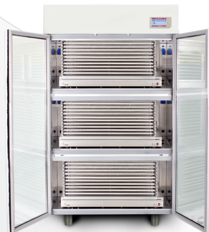
Climax 200 Touch