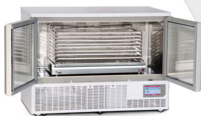
Climax 120 Touch