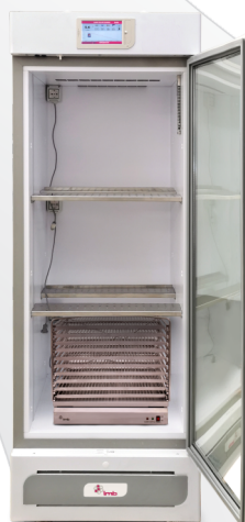
Climax 150 Touch