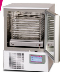
Climax 100 Touch