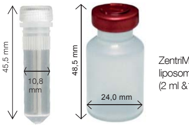
ZentriMix-vials for liposome production (2 ml &10 ml)