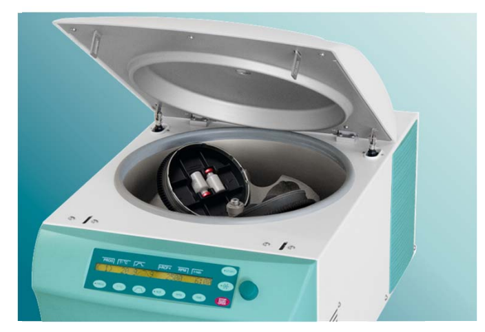
ZentriMix 380 R